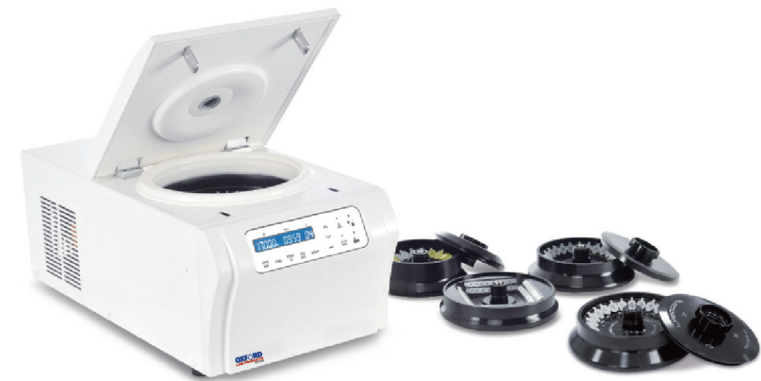
CH27R 17,000 / 27,237 xg 30 x 1.5/2.0 ml