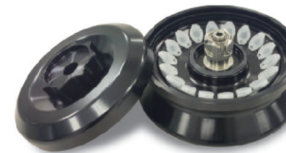
Fixed Angle Rotor, GRE-M-m2.0-18 18 x 1.5/2.0 ml ∠ 45° Hole diameter (mm) : 11.1 Max. height for tube fit (mm) : 65