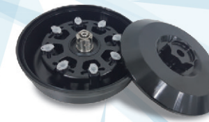
Swing-out Rotor, GRD-M-m2.0-8 8 x 1.5/2.0 ml ∠ 90° Hole diameter (mm) : 11.1 Max. height for tube fit (mm) : 48