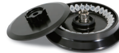
Fixed Angle Rotor, GRE-M-m2.0-30 30 x 1.5/2.0 ml ∠ 45° Hole diameter (mm) : 11.1 Max. height for tube fit (mm) : 52