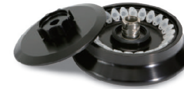
Fixed Angle Rotor, GRE-M-m2.0-24 24 x 1.5/2.0 ml ∠ 45° Hole diameter (mm) : 11.1 Max. height for tube fit (mm) : 52