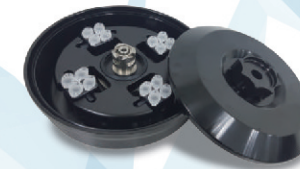
Swing-out Rotor, GRD-M-m2.0-16 16 x 1.5/2.0 ml ∠ 90° Hole diameter (mm) : 11.1 Max. height for tube fit (mm) : 43