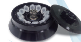
Fixed Angle Rotor, GRE-M-m5.0-12 12 x 5.0 ml ∠ 45° Hole diameter (mm) : 17 Max. height for tube fit (mm) : 68